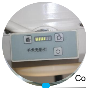
Control panel, switch on/off & 10 grade intensity adjustment