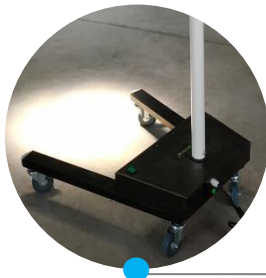
Optional stainless base, 7.8ah lithium battery, last 4 hours once fully charged