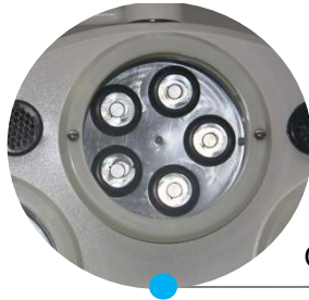
Osram LED lighting deliver cool, white bright light;